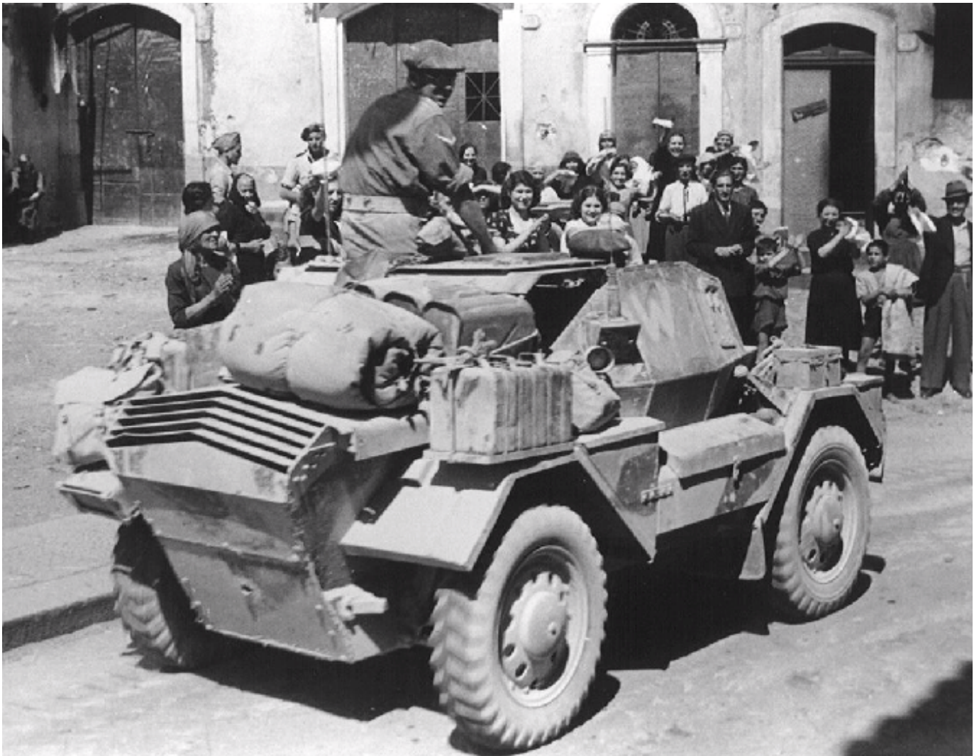
Sicily