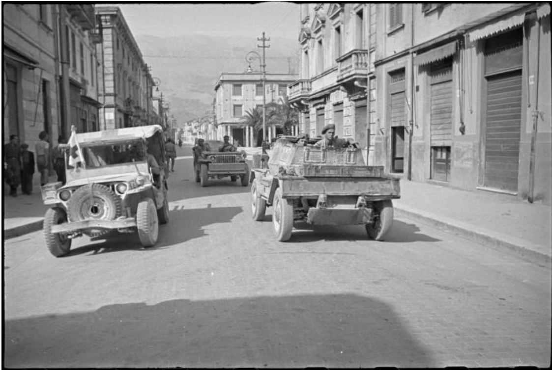
Description: A New Zealand Dingo makes its way along a street in Sora, Italy, World War II